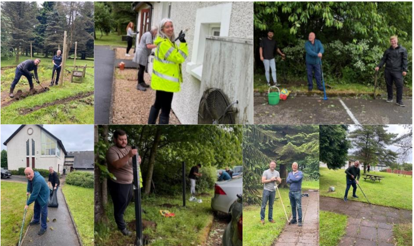
Scottish Water Volunteer Day

Scottish Water regularly hire our facilities for team meetings and, for the past four years, have also chosen Craighalbert for their volunteer day. This year 30 volunteers from their team supported us by clearing the garden area, painting, and installing new disabled parking signs.