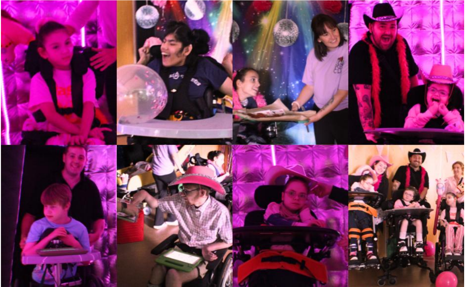
Summer club celebrations

Summer Club ended on a high with a pink pony themed Summer Club celebration, chosen by Maple Room using AAC. Pupils came together in colourful clothes, cowboy hats, and big smiles for an afternoon of music, props, dancing, and joy.