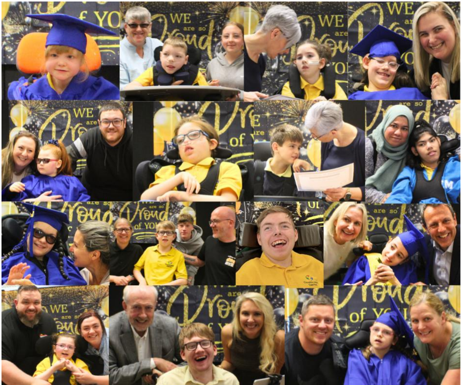
Craighalbert celebration of achievement and graduation event

It was especially meaningful to be joined by families and friends, whose support plays such an important role in each child's journey. Together, we were able to celebrate not only these key milestones but also the individual progress and achievements of every pupil, making the event a true celebration of the whole Craighalbert community.