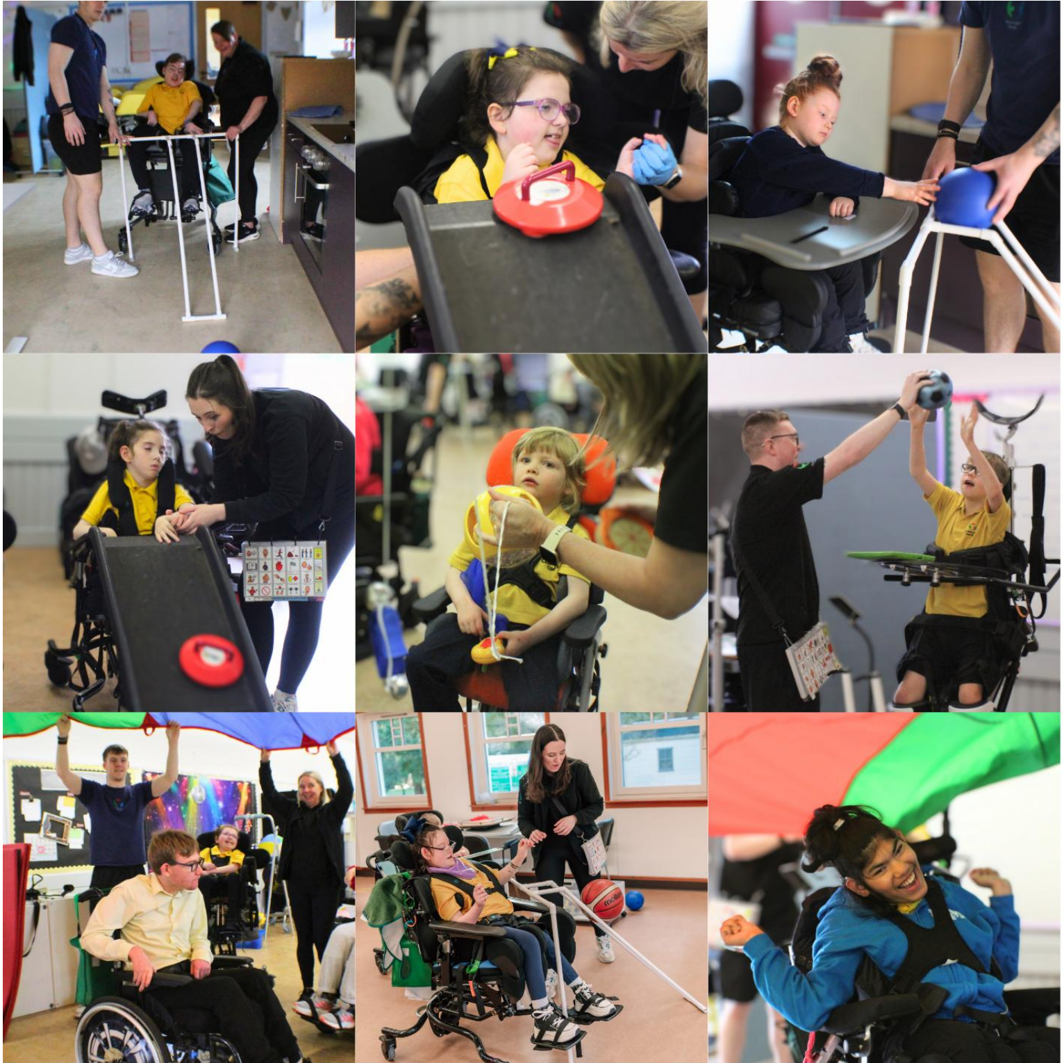
National School Sports Week – Motor Activity Training Programme sessions

For National School Sports Week (16th–22nd June), we shared highlights from a fantastic Motor Activity Training Programme (MATP) session. Pupils took part in parachute games, curling, bowling, throwing, catching and more, with every activity adapted to their needs and interests. MATP is all about participation, inclusion, and fun, helping children to develop physical skills, confidence, and friendships.