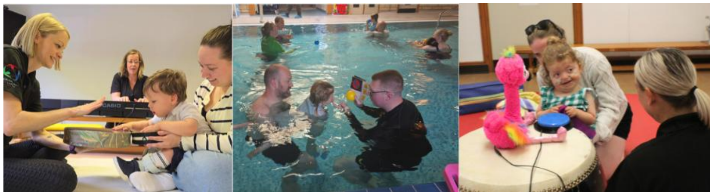
Early Intervention at Craighalbert

Sessions are planned by the relevant therapy or education specialists leading the block and delivered by two of our Learning, Care and Therapy Practitioners. The programme is designed to give parents practical knowledge and strategies on how to support their child's development through play.