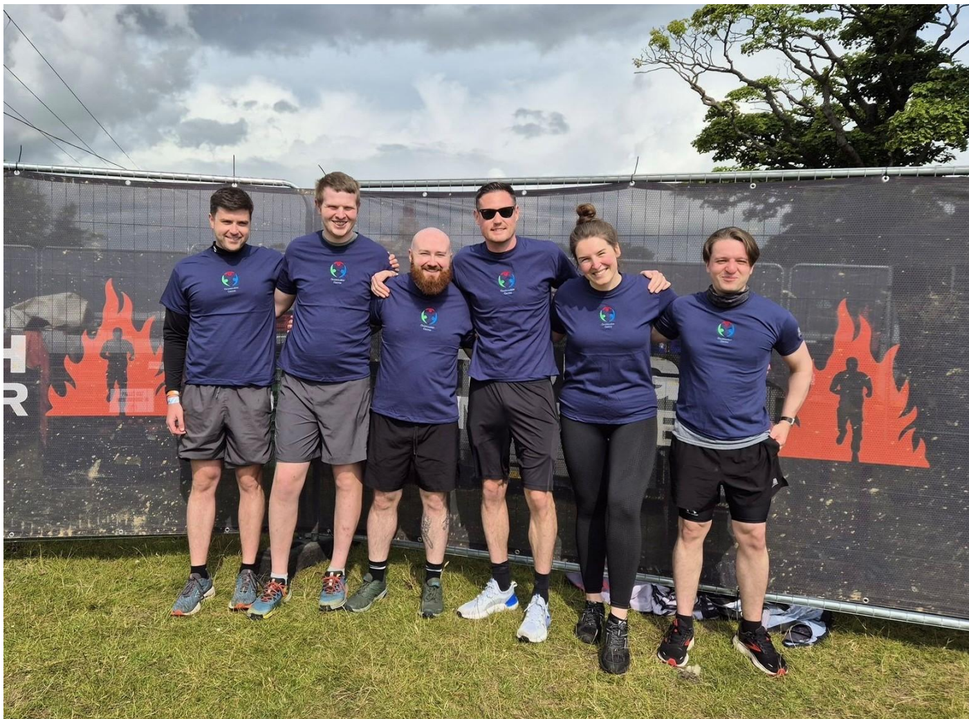
QinetiQ Rosyth Team participating in Tough Mudder

6 members of QinetiQ Rosyth took part in Tough Mudder, raising £668.75 for the Centre. We are so grateful to the group for choosing to support us, their efforts will make a real difference to the children and families we work with every day.