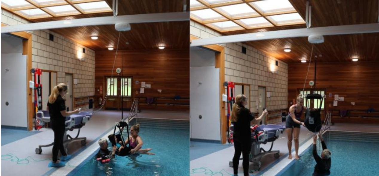
New pool hoist in action

With funding from Children’s Aid, a new track hoist has been installed in the hydrotherapy pool area, along with wet walls and upgraded changing facilities. This now enables children to be hoisted directly from the changing area into the pool, reducing the need for additional transfers.