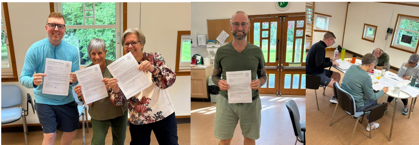
Pool Plant Training

4 members of staff successfully completed Pool Plant training, ensuring we maintain strong operational knowledge and compliance within our hydrotherapy provision.