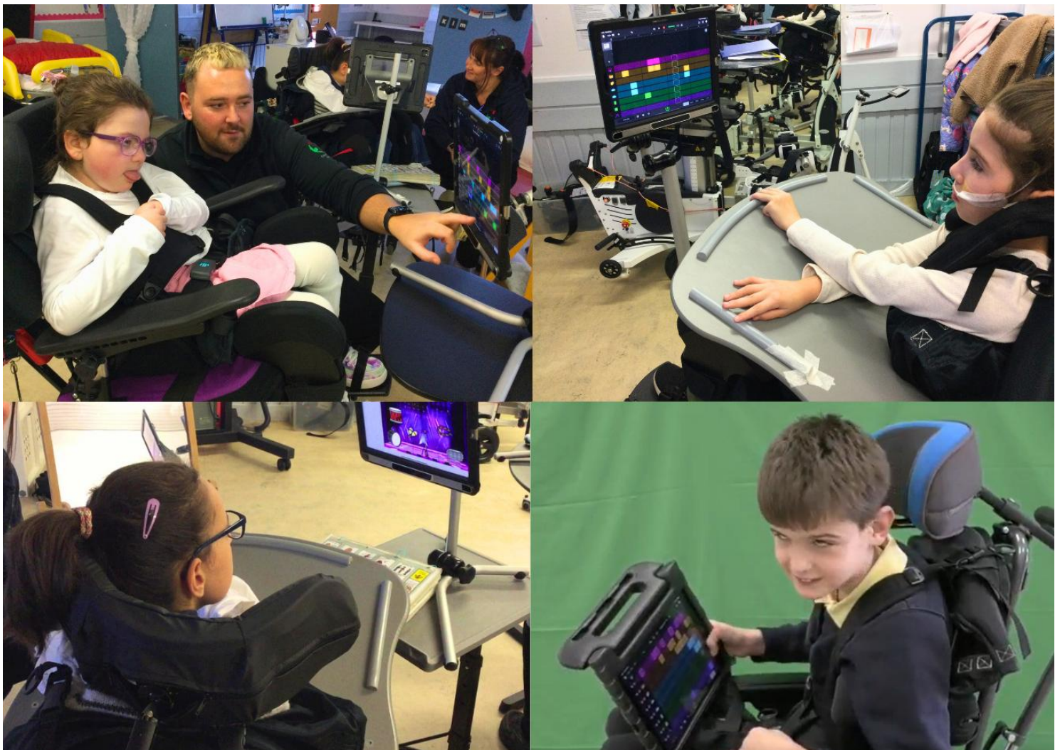
Using eyegaze to explore music through GarageBand

This period has also seen continued innovation in how pupils access learning, creativity, and physical activity, underpinned by our commitment to removing barriers and promoting wellbeing. Pupils have been using eyegaze technology to explore music-making through GarageBand, enabling them to compose, experiment, and express preferences in meaningful ways. These sessions have powerfully reinforced pupil voice in practice; when provided with the right tools, children often make choices that reflect their own interests and motivations, sometimes taking learning in directions different from those originally planned by staff. This responsiveness to pupil-led learning is a key strength of our approach.