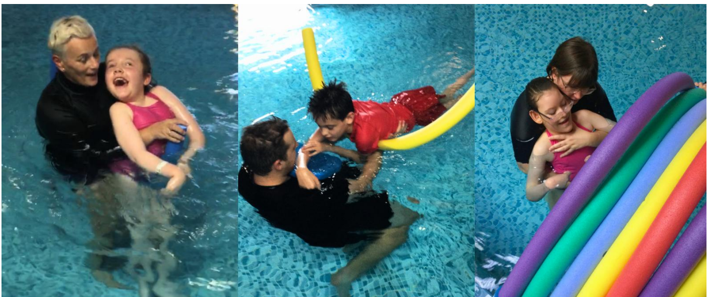
Enjoying time in our hydrotherapy pool

Hydrotherapy continues to play a vital role in supporting both wellbeing and development. While sessions are enjoyable and highly motivating, they also provide significant therapeutic benefits, allowing pupils to move more freely, build strength, relax, and work towards personalised learning and developmental goals. Above all, the hydrotherapy pool is a space where pupils feel happy, confident, and secure, reinforcing the strong link between emotional wellbeing, physical health, and readiness to learn.