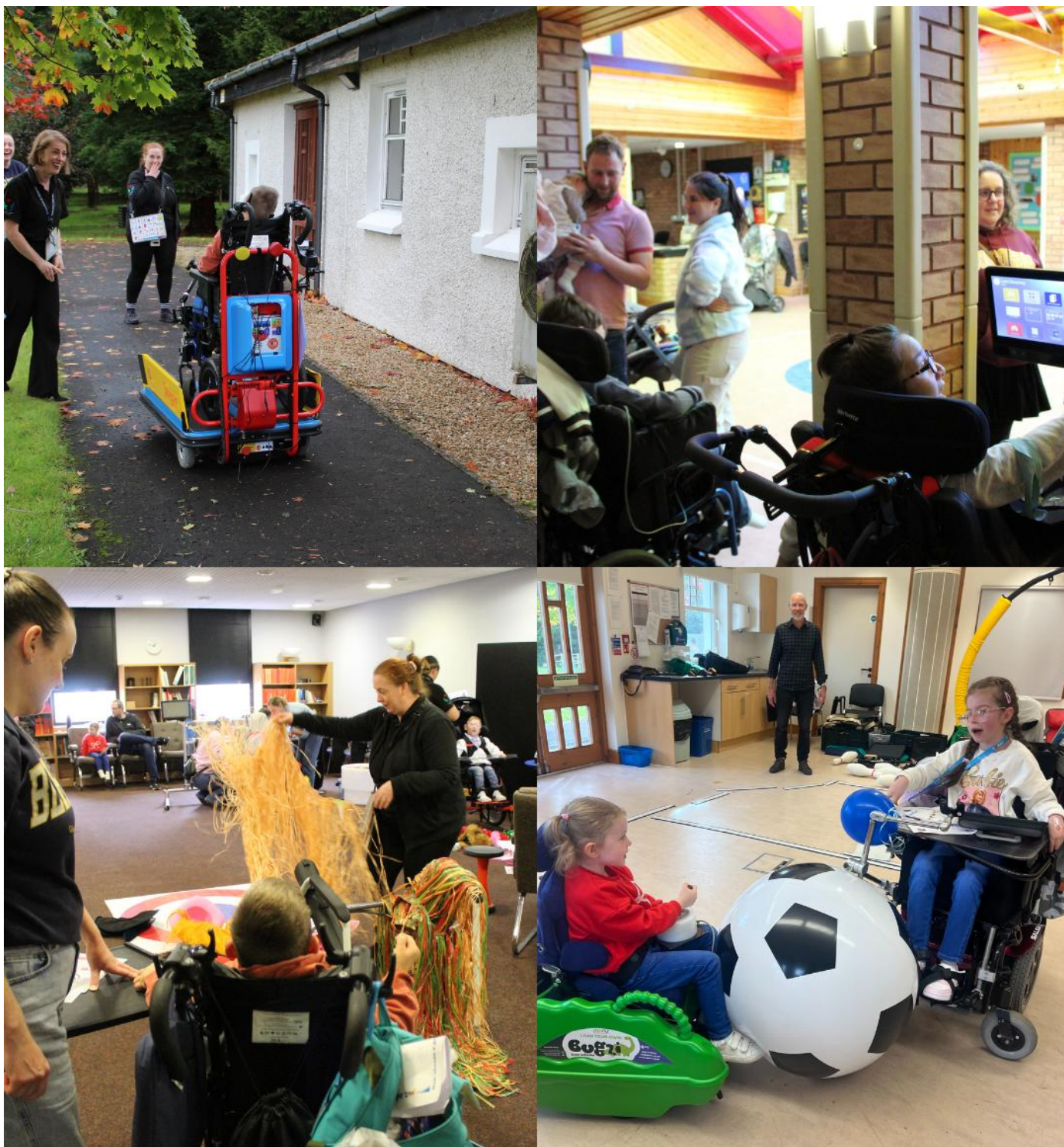
AAC Scotland Family Fun Day at Craighalbert

On 4th October, we were pleased to host the AAC Scotland Family Fun Day at Craighalbert. Families from across Scotland attended to explore a wide range of communication supports, assistive technologies, and interactive learning experiences. Activities included Drive Deck demonstrations, Bookbug storytelling, arts and crafts, Tin Can Alley, dancing, and DJ sessions. This event showcased the Centre's expertise in AAC and Assistive Tech and strengthened connections with families and partner organisations.