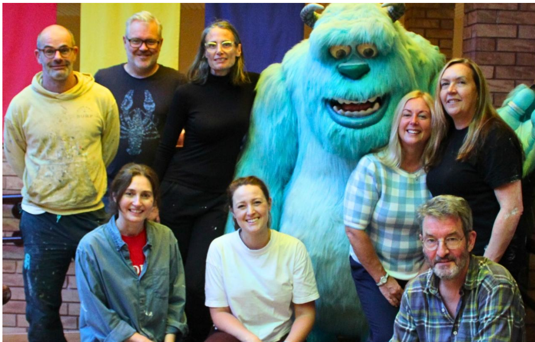
William Grant Volunteers at Craighalbert

We were delighted to welcome a volunteer team from William Grant & Sons, who supported the Centre by repainting several spaces and offices. Their contribution has significantly improved our environment, and we are grateful for their professionalism, teamwork, and enthusiasm.