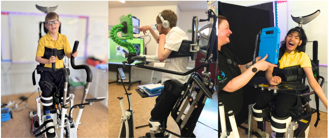
Pupils using the Innowalk Pro

Supporting physical health and wellbeing remains a priority, with a clear focus on enabling participation in line with government guidance on physical activity for children with disabilities. The Centre has both a small and a large Innowalk, which are used regularly to enhance pupils' physical health while simultaneously supporting engagement and learning within the classroom environment.