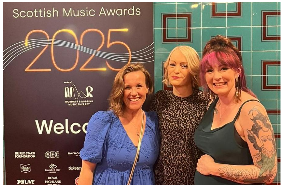
Attending the Scottish Music Awards