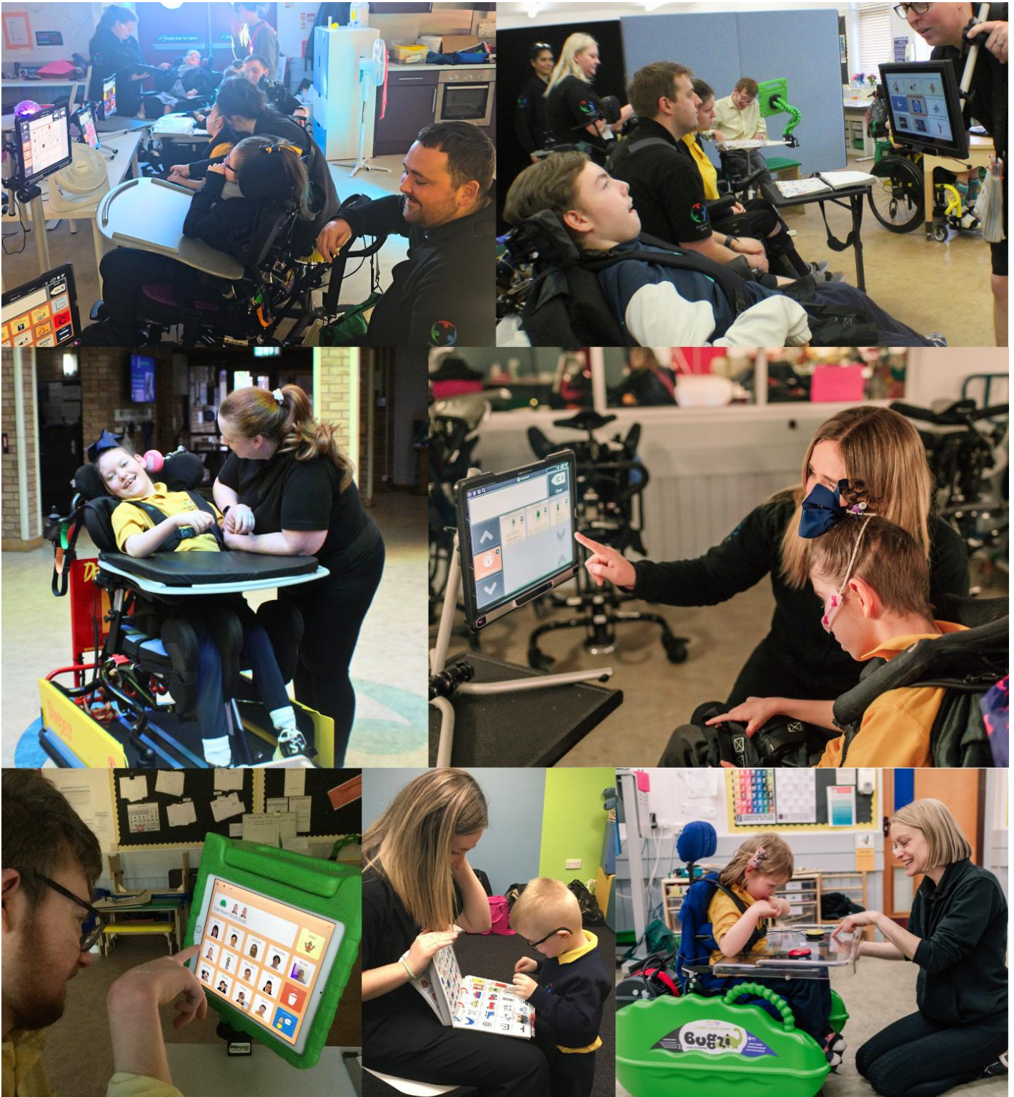
Switch and AAC Skills in Action

Our pupils continue to demonstrate their phenomenal progress in switch skills. One of our pupils took great joy in showcasing her abilities on the Drivedeck, knocking over a member of CLT (thankfully just a cardboard skittle!). Another pupil demonstrated her AAC skills by using her Eyegaze to sneakily play music during class, a cheeky but delightful moment that reminded us just how much personality comes through with increased communication opportunities.