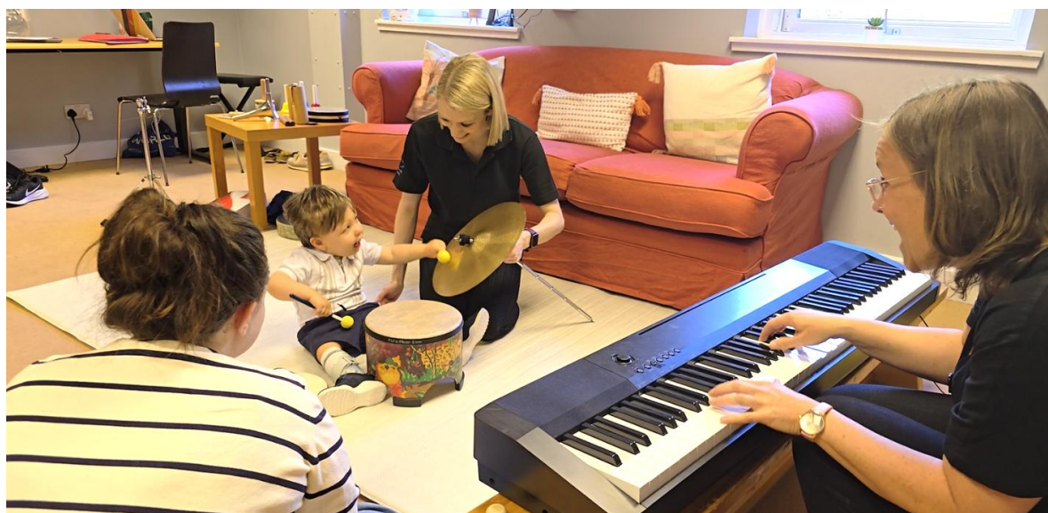
Music Space Programme

Our Music Space programme is currently fully booked, with a small but growing waiting list.