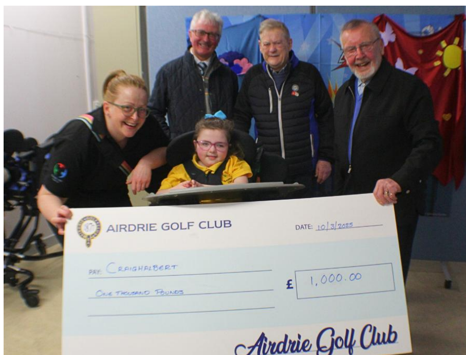
Airdrie Golf Club Members Presenting Donation

We received a donation of £1,000 from Airdrie Golf Club, following their successful Burns Supper fundraising event and were delighted to welcome three members of the golf club to the Centre, who all stated how impressed they were with the care that they witnessed on their visit.