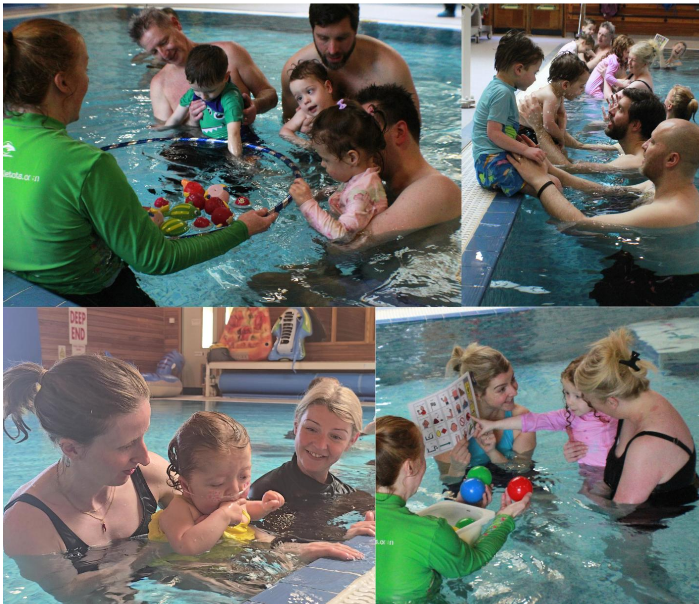
Water Space Programme

Our Water Space programme now has 18 families registered for sessions, with a small waiting list. Currently we are engaging with children from several local authority areas including Dunblane, Barrhead, Greenock, Musselburgh, Islay, Fife and Perth and Kinross, extending our national reach.