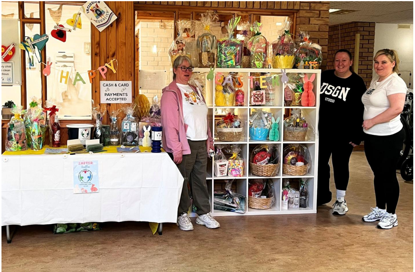
Parent Council members setting up their raffle display.

A huge thank you to the parent council and everyone who contributed through donations and purchasing raffle tickets.