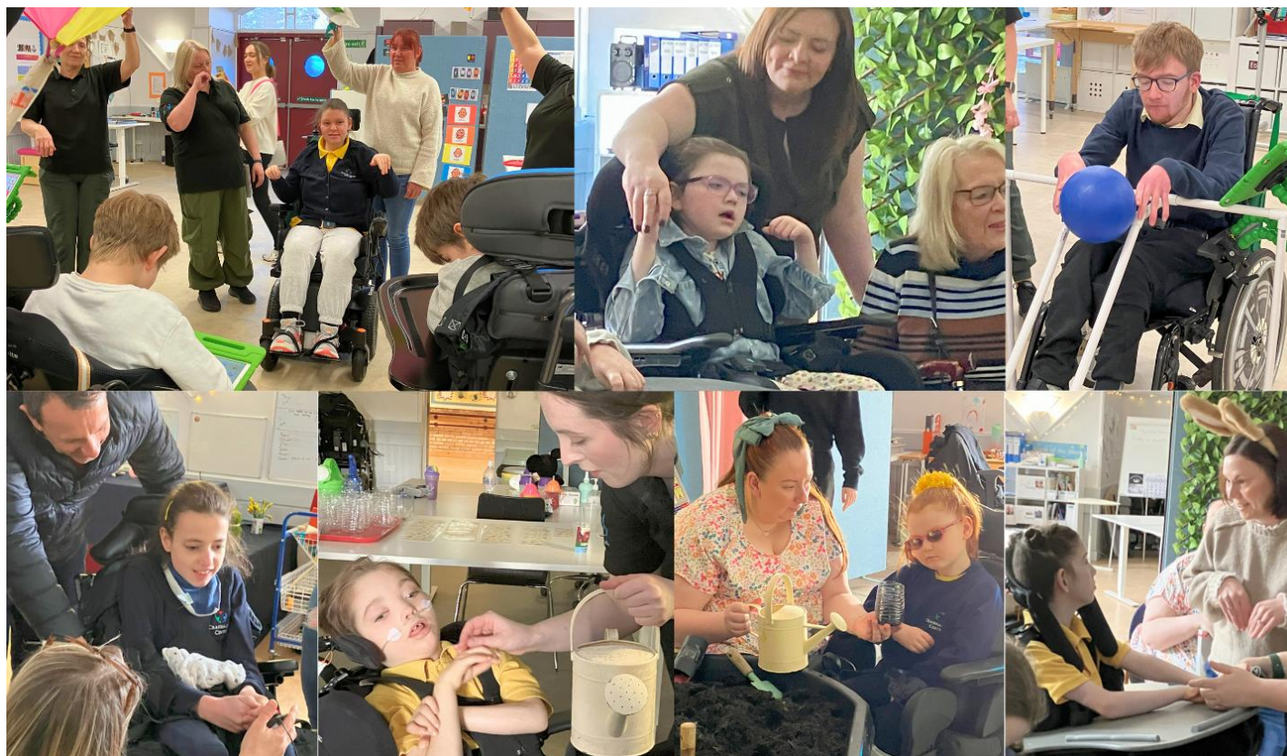
Daffodil Tea Celebrations

On 28 th March we hosted our Daffodil Tea, with families joining in with special activities including seed planting in recycled bottles, as part of our sustainability focus. Oak room wowed everyone with an interactive story they wrote themselves using AAC aids (Augmentative and Alternative Communication) and a little help from AI and everyone got moving in an MATP (Motor Activity Training Programme) session, using recycled materials throughout to keep things green.