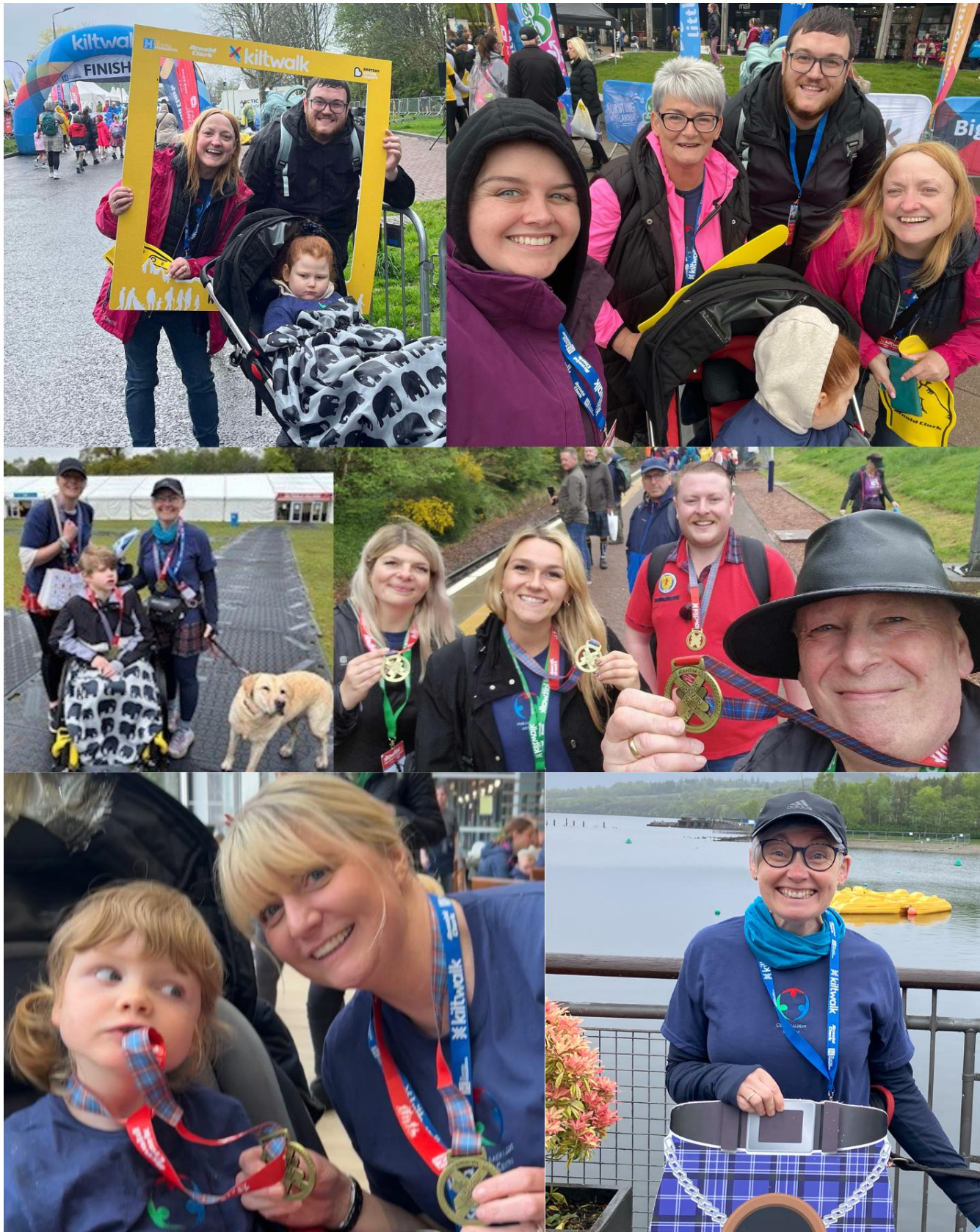
Fundraisers taking part in the Kiltwalk to raise funds for the Centre

This years Glasgow Kiltwalk was held on Sunday 27 th April, we had 14 participants, including pupils, families and staff, taking part who raised a total of £2,625.40 for the Centre.