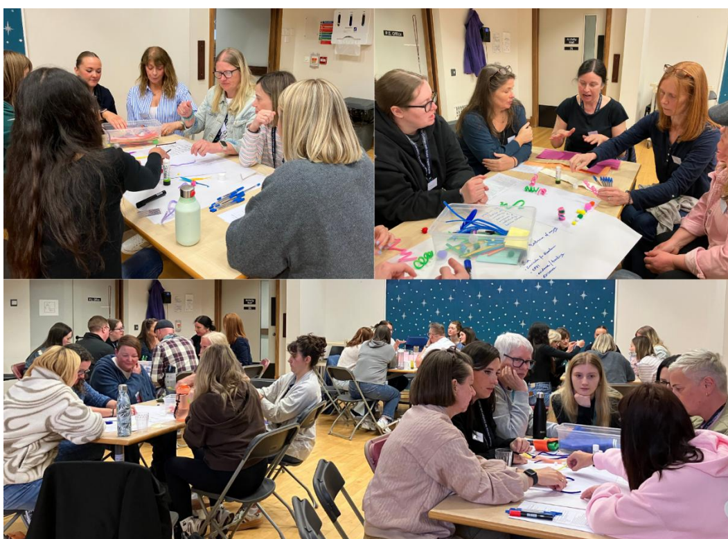
Joint Inservice Day with Royal School for the Blind